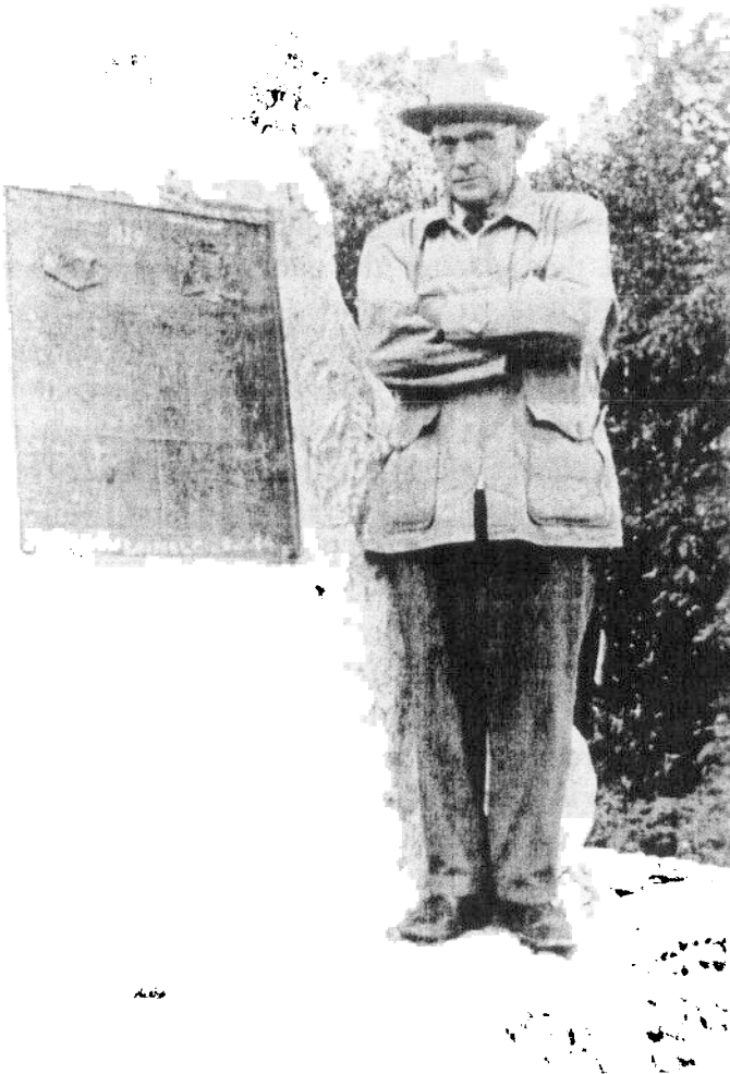
Beside the cairn commemorating the completion of part of the Trans-Canada Highway in 1932, at the Manitoba-Ontario border